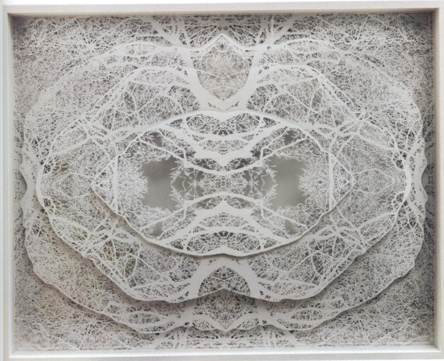
Left: Harmonic Landscape , 2013, Handcut paper and digital prints. h: 60cm w: 106cm d: 7cm, Artist's Collection.